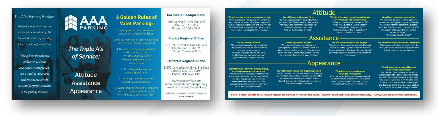
AAA Parking Service Standards Employee Wallet Card

AAA Parking's commitment to service resonates through every facet of organization. With company programs like the AAA Basics of Service, AAA Parking Leadership and our weekly employee recognition program, our focus on providing exceptional and consistent service is unmatched in the industry.